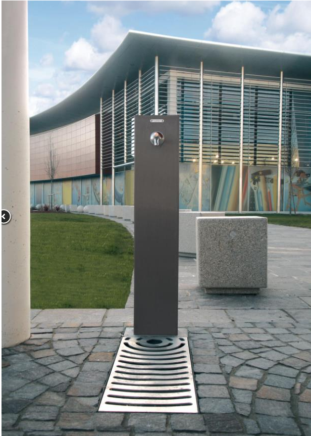
Like this picture but with water bubbler on top – includes bottle fill and drinking fountain