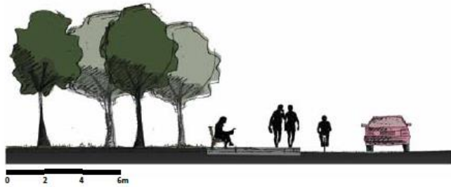
Section elevation through promenade showing seating.

Improving pedestrian use and enjoyment of the Square